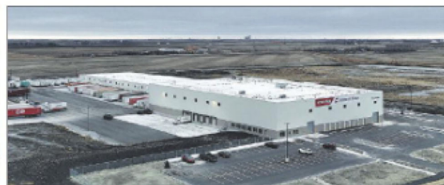
Fastfrate Group is open and operational in the CentrePort Canada Rail Park - the first company to open in this unique rail-served industrial park.