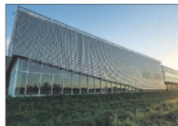
NRC Winnipeg: National Research Council of Canada's (NRC) $60 million advanced manufacturing research facility opened in 2022.